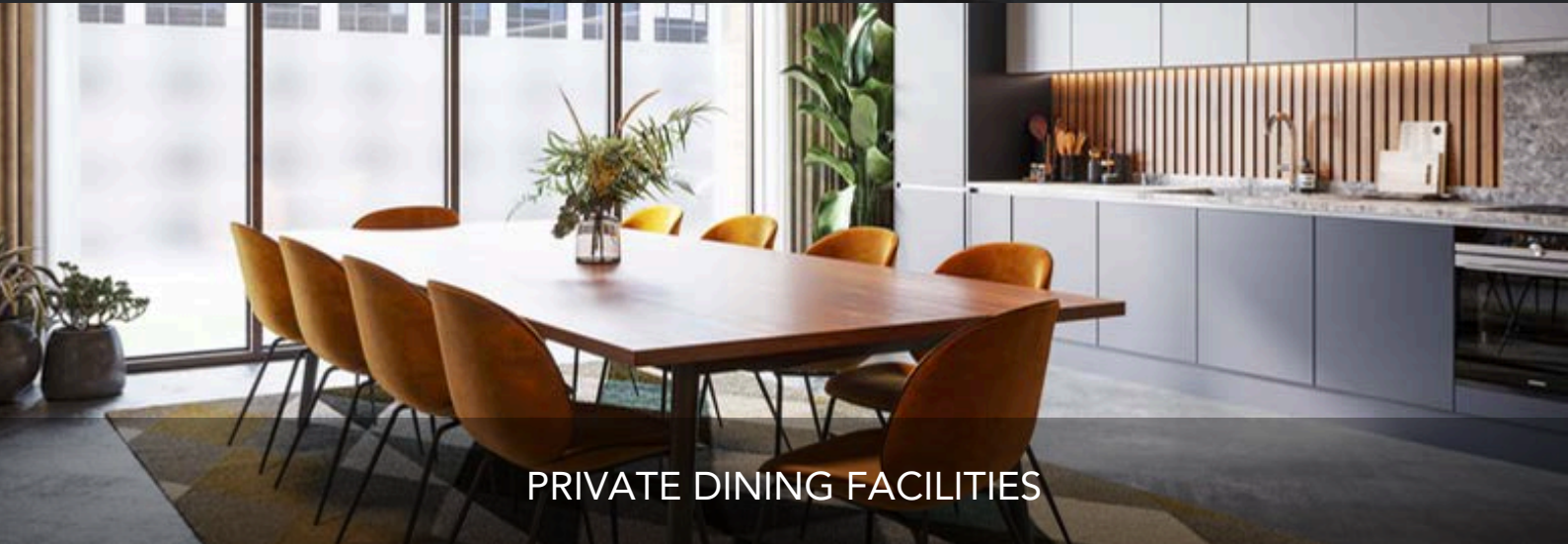
PRIVATE DINING FACILITIES

GYMNASIUM | CINEMA ROOM | PRIVATE DINING FACILITIES LOUNGE AREA ACCESS | CO-WORKING SPACE | RESIDENTS LOUNGES ROOFTOP GARDEN | SECURE CAR PARKING | CONCIERGE SERVICES