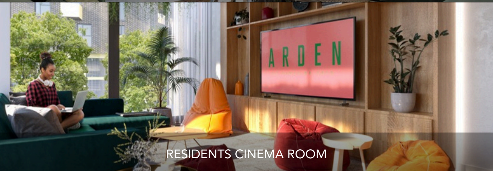
RESIDENTS CINEMA ROOM